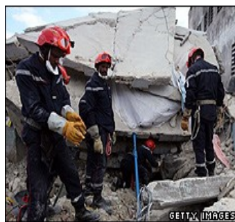
Many rescuers such as these from France are doing their part to help return Haiti back to normal.